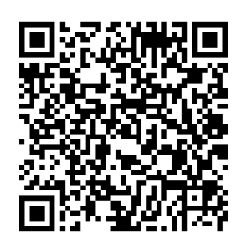
For further details